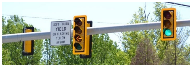
Flashing Yellow Arrow Installation in Virginia

VDOT works hard to provide a roadway network that operates safely, efficiently, and effectively. In 2019, the Commonwealth Transportation Board approved the deployment of highly effective, low-cost safety improvements to help reduce serious injury and fatal crashes across the Commonwealth. This data-driven strategy focuses on proactively targeting locations with higher crash risk. The goal is not to wait for crashes to occur before we proactively treat high-risk locations on the roadway network!